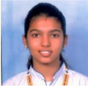
Impana V 94.47%