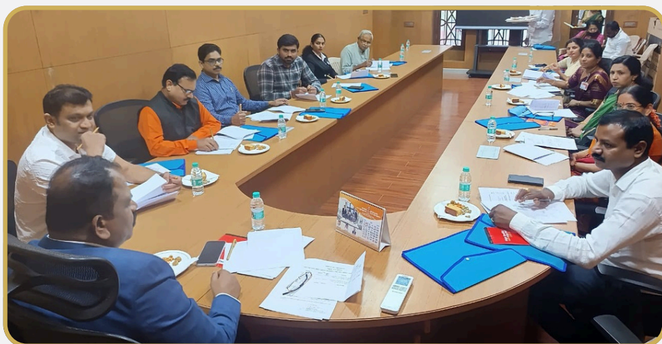
NSS Advisory Committee Meeting – BCU