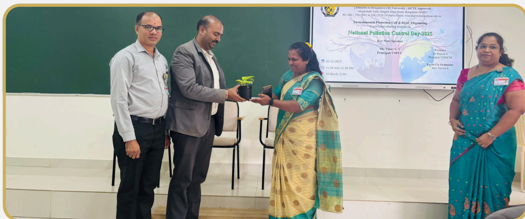
National Pollution Control Day