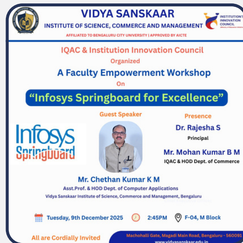
Infosys Springboard for Excellence