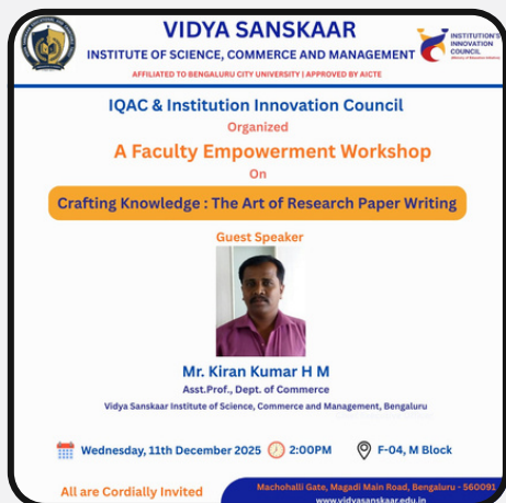
Research Paper Writing