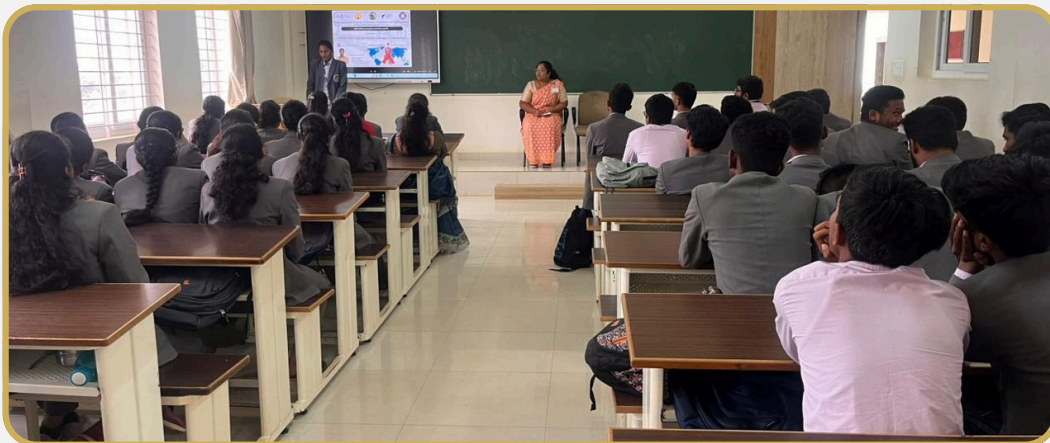
AIDS Awareness Programme