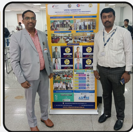
IIC Regional Meet