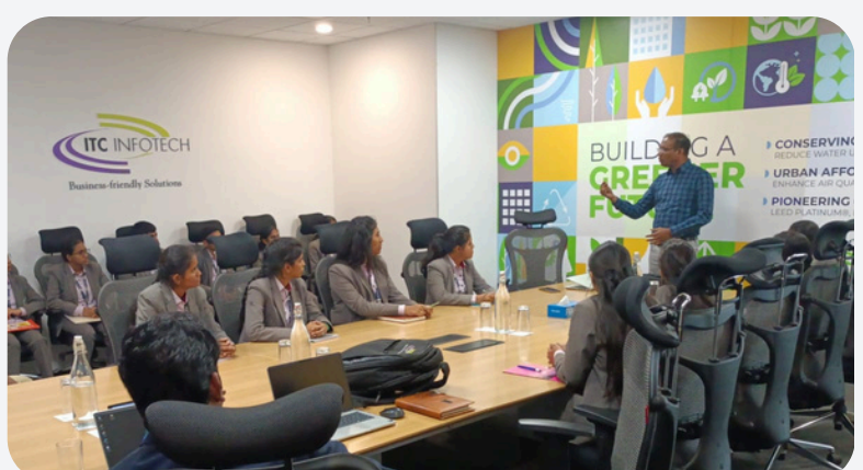
Company Visit : ITC Infotech India Pvt. Ltd