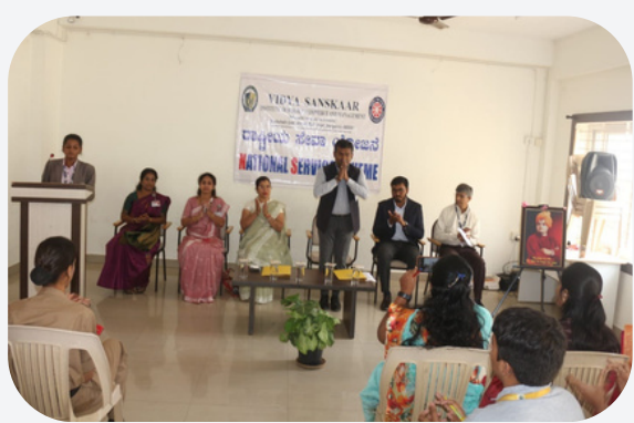
National Youth Day