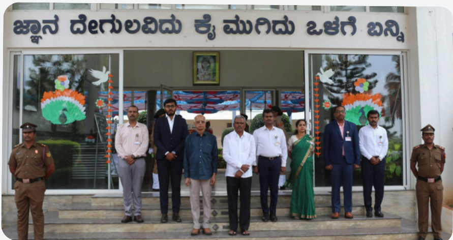
Republic Day 2026