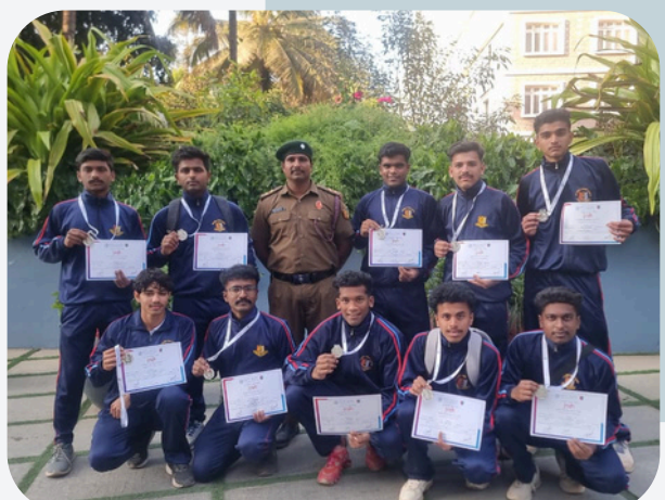
NCC Volleyball Competition