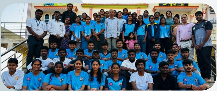
NSS Special Camp : Kitthanahalli