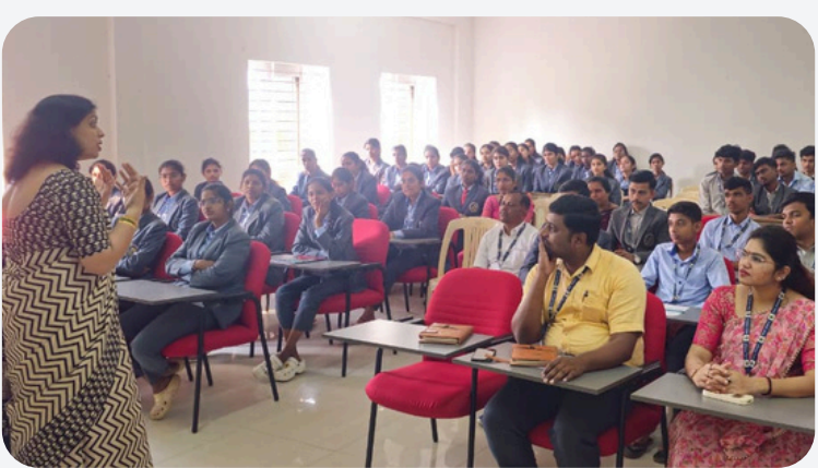
National Start-up Day